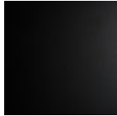
OP17 noir mat