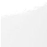
L7 laqué blanc brillant