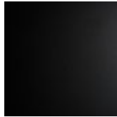
OP17 noir mat