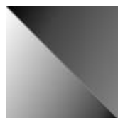
extra clair graphite