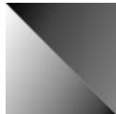
extra clair graphite