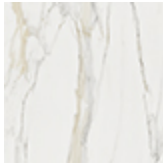
OD05 Golden Calacatta opaque