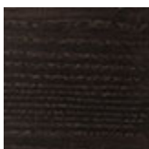
W2 dark wenghè