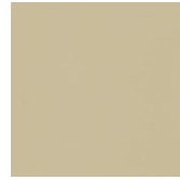
97 PANNA coutures BEIGE