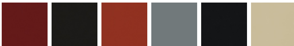
89 ROSSO CORSA coutures NOIR