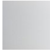
GFM71 gaufré blanc