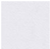
LM02 blanc climb