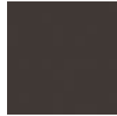
LM21 gris Londres Fenix