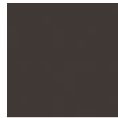
LM21 gris Londres Fenix