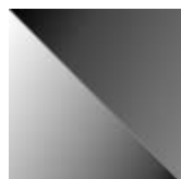
extra clair graphite