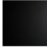
OP17 noir mat