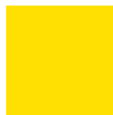
OP86 jaune mat