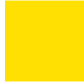
OP66 jaune mat