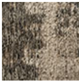
chenille du coton Darwin