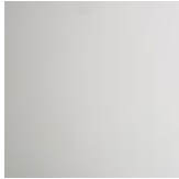
OP71 blanc mat