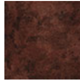
OP40 acier verni cuivre