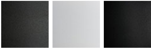
GFM69 gaufré graphite