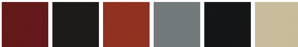
89 ROSSO CORSA coutures NOIR