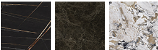
KM09 Sahara Noir brillant