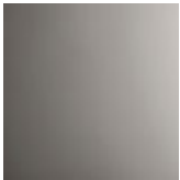
acier inox poli