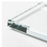
transparent extra clair