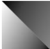
extra clair graphite