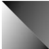
extra clair graphite