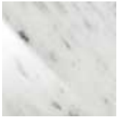
BC blanc Carrara brillant