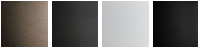
11 titane satiné