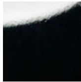
L3 lacqué noir brillant