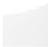
L7 lacqué blanc brillant