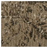
chenille du coton Delhi