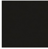
91 TESTA DI MORO coutures NOIR