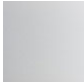
GFM71 gaufré balnc