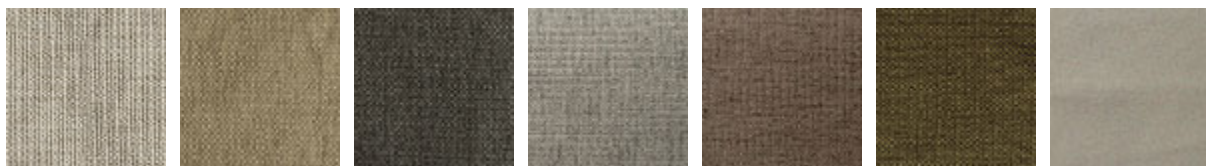
B400 B401 B402 B403 B404 B405 B500