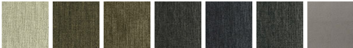
B100 B101 B102 B103 B104 B107 B200