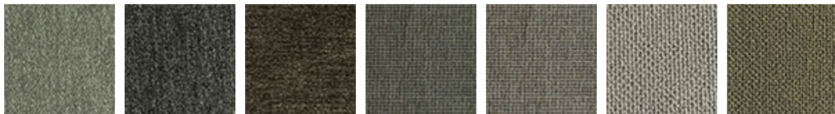
B301 B302 B303 B306 B307 B309 B310