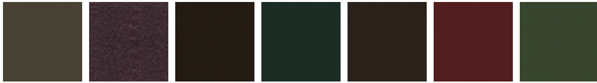
983 ARGILLA 984 BRONZO 985 RESINA 987 SHERWOOD 988 TABACCO 989 ROSSO CORSA 990 SALVIA