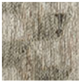
chenille du coton noir Rubik