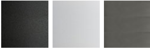
GFM69 gaufré graphite