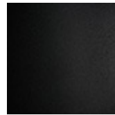
GFM73 goffrato nero