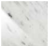
BC белый Carrara полированный