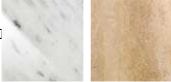
BC 0000 Carrara 0000000000