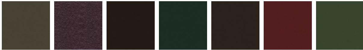
983 ARGILLA 984 BRONZO 985 RESINA 987 SHERWOOD 988 TABACCO 989 ROSSO CORSA 990 SALVIA