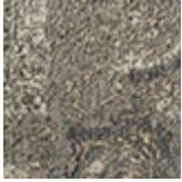
00000000 000000 Chennai