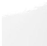
L7 белый глянцевый лак