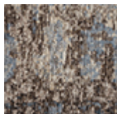
хлопковой синели Radja