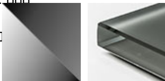
Pannello in PVC (PVC) con struttura a rete, disponibile in diverse colorazioni e finiture.