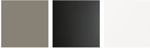
OP30 grey OP69 graphite OP71