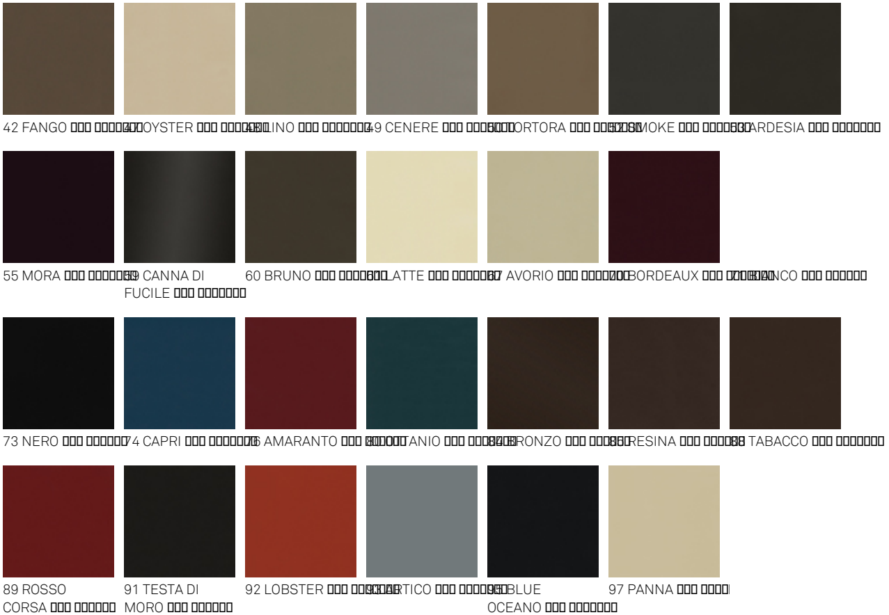
42 FANGO 000 00000000 43 COYSTER 000 00000000 44 LINO 000 00000000 49 CENERE 000 00000000 50 TORTORA 000 00000000 51 MOKE 000 00000000 52 ARDESIA 000 00000000