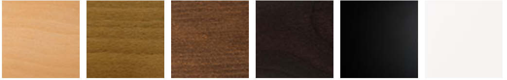
F1 000 00000000000000 28 00000000000000 29 00000000000000 47 00000000000000 wenghe 47 00000000000000 P7 0000 00000000