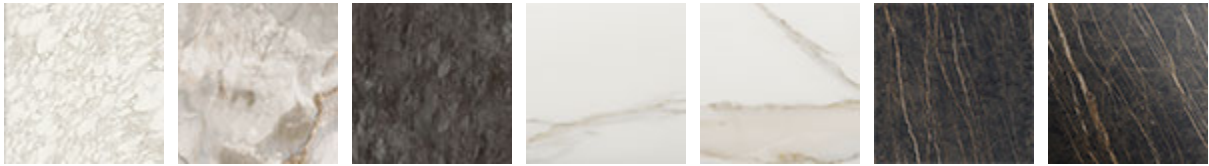
KM01 Calacatta KM02 Alabastro KM04 Ardesia KM05 Golden Calacatta KM06 Golden Calacatta KM07 Portoro KM07 Portoro