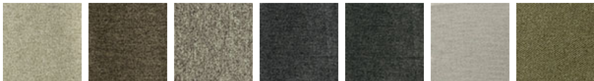
B501 B502 B503 B504 B506 B600 B601