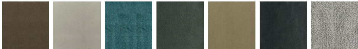
B201 B202 B203 B204 B205 B207 B300