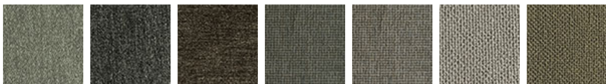
B301 B302 B303 B306 B307 B309 B310