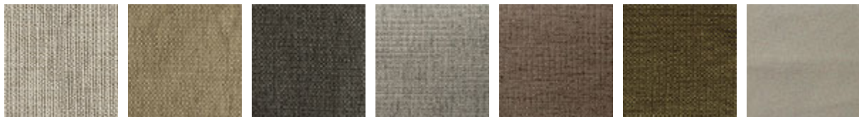
B400 B401 B402 B403 B404 B405 B500