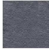
PL73 NERO PERLATO LUCIDO