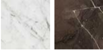
BCO □□□□ Carrara ■■■■■■ Nero Marquina □□□□□□