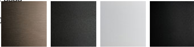
11 satin titanium