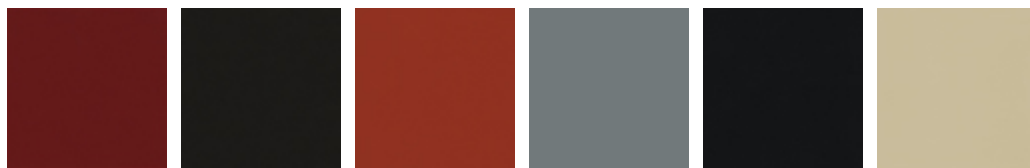
89 ROSSO CORSA 91 TESTA DI MORO 92 LOBSTER 93 SCABETICO 95 BLUE OCEANO 97 PANNA