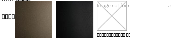
GFM11 GFM12 GFM13 GFM14