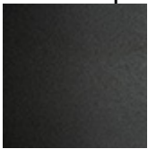
GFM69 гофрированная сталь окрашенная в графит