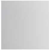
GFM71 гофрированная сталь окрашенная в белый