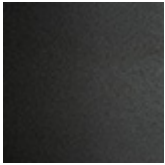
GFM69 гофрированная сталь окрашенная в графит