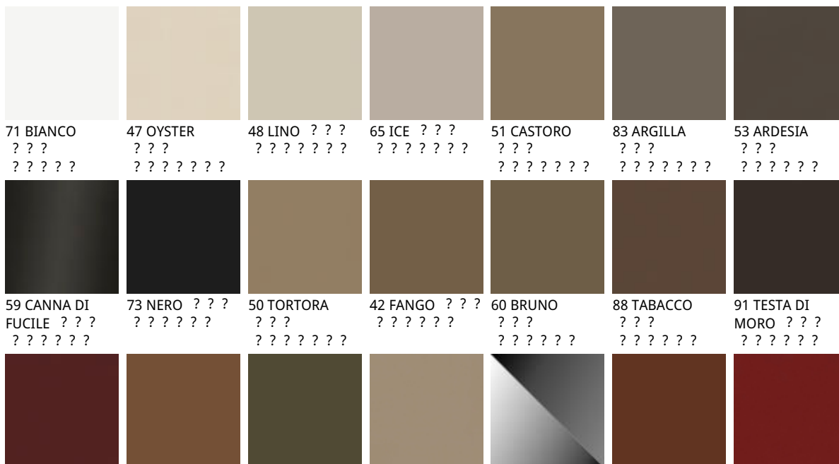
71 BIANCO ? ? ? ? ? ? ? ? 47 OYSTER ? ? ? ? ? ? ? ? ? ? 48 LINO ? ? ? ? ? ? ? ? ? ? 65 ICE ? ? ? ? ? ? ? ? ? ? 51 CASTORO ? ? ? ? ? ? ? ? ? ? 83 ARGILLA ? ? ? ? ? ? ? ? ? ? 53 ARDESIA ? ? ? ? ? ? ? ? ? 59 CANNA DI FUCILE ? ? ? ? ? ? ? ? ? 73 NERO ? ? ? ? ? ? ? ? ? 50 TORTORA ? ? ? ? ? ? ? ? ? ? 42 FANGO ? ? ? ? ? ? ? ? ? 60 BRUNO ? ? ? ? ? ? ? ? ? 88 TABACCO ? ? ? ? ? ? ? ? ? 91 TESTA DI MORO ? ? ? ? ? ? ? ? ? 70 BORDEAUX ? ? ? ? ? ? ? ? ? 82 COGNAC ? ? ? ? ? ? ? ? ? 21 OLIVA ? ? ? ? ? ? ? ? ? 69 CASHMERE ? ? ? ? ? ? ? ? ? 72 CANOVA ? ? ? ? ? ? ? ? ? 81 BARRIQUE ? ? ? ? ? ? ? ? ? 98 RED ? ? ? ? ? ? ? ? ?