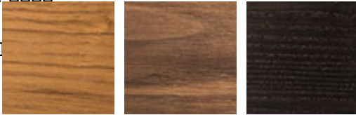
HR 0000000000 000NC 000000000000 0000 000000 wenghé