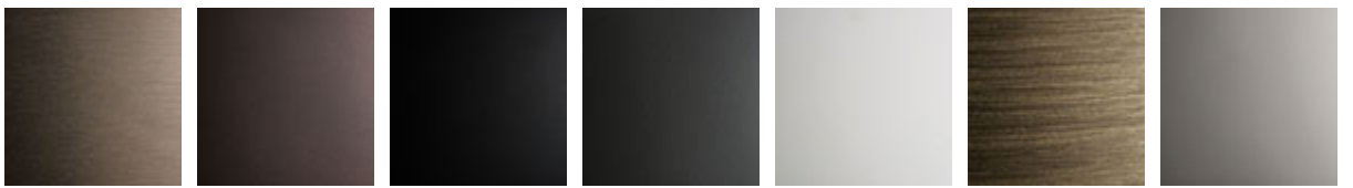
11 satin titanium 15 satin bronze OP17 000000 000000P69 000000 000000P71 000000 000000000000 000000000000 000000