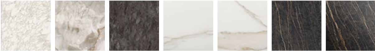
KM01 Calacatta KM02 Alabastro KM04 Ardesia KM05 Golden Calacatta 00000000 KM06 Golden Calacatta 000000000000 KM07 Portoro 00000000 KM07 Portoro 000000000000