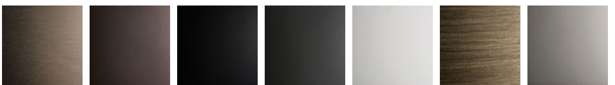
11 satin titanium 15 satin bronze OP17 000000 00000000 P69 000000 00000000 P71 000000 00000000000000 000000000000 000000