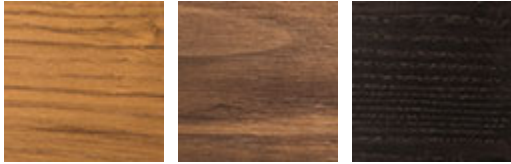
NC 000000000000 0002 000000 wenghé