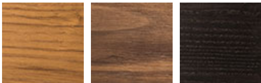
NC 000000000000 0002 000000 wenghé