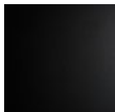
OP17 черный матовый