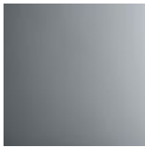
08 ? ? ? ?