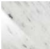
BC белый Carrara полированный