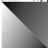
satin iron grey