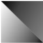
satin iron grey